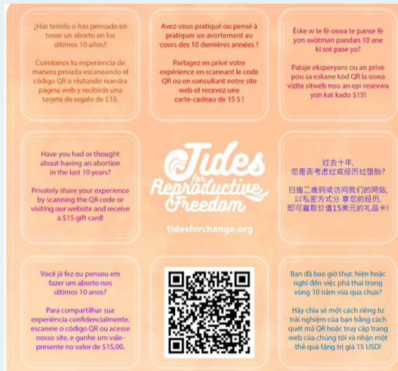
A flyer with the Tides for Reproductive Freedom logo in the middle and a QR code that reads, "Have you had or thought about having an abortion in the last 10 years? Privately share your experience by scanning the QR code or visiting our website and receive a $15 gift card" in seven languages

Grassroots: On-the-ground distribution to direct constituents through tabling and QR codes.