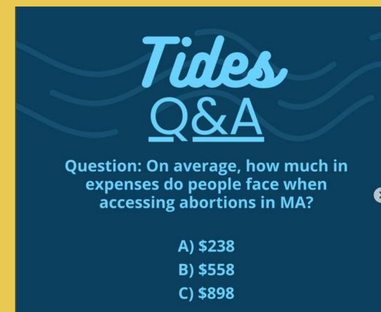
A screenshot of a Tides Instagram post that reads, "Q&A On average, how much in expenses do people face when accessing abortions in MA?" with three options "A- $238, B-$558, or C-$898."