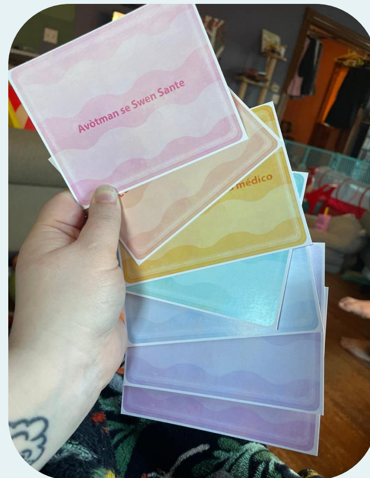
A hand holds seven small flyers, all in different colors and different languages, reading "Abortion is healthcare" with a QR code to the survey.